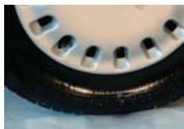
30 minutes after application