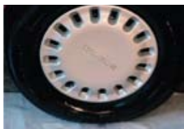
15 minutes after application